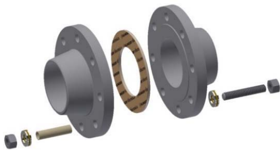
Figure 1 – Typical assembly with GW1 washers

Each insulation set comes with a KLINGER Shield insulation gasket, insulating washer set, high temperature insulation sleeves.