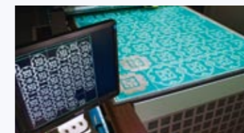
Images: Klinger Waterjet and Knife Cutting machines